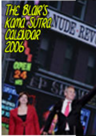
THE BLAIR'S KAMA SUTRA CALENDAR 2006