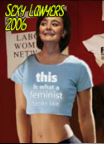
SEXY LAWYERS 2006

The filth and nonsense in this calendar is entirely made up, merely the sick imaginings of a clearly unwell man. Libel lawyers please visit www.waspbox.com Image manipulations and text copyright Wasp Box 2006.